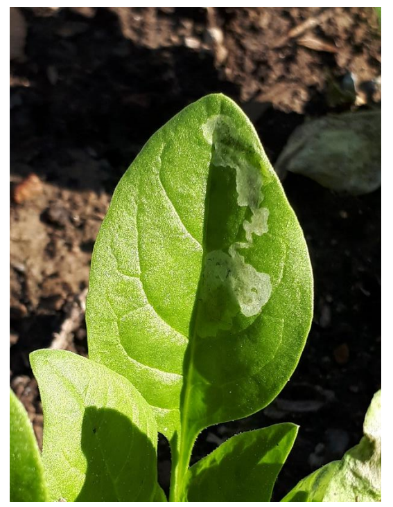
late stages-remove leaf